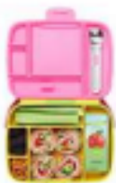
Packed Lunch and Snacks (NUT-FREE)