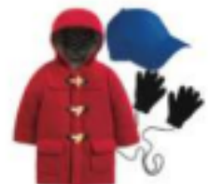
Weather Appropriate Clothing