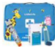
Medication If Required